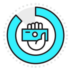
88% of customers buy immediately or as soon as possible rather than wait for their next trip<sup>5</sup>